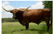
ROE'S DANDY 24/1